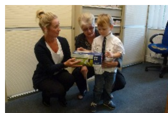
Local Community Scheme