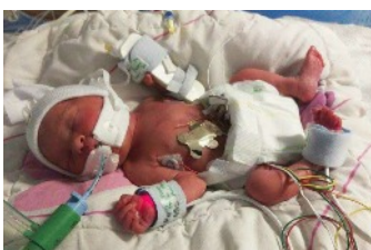
Supporting fragile life