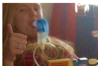
Help others take a breath